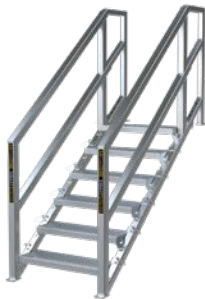
6 TO 10 STEPS