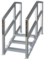
3 TO 5 STEPS

Smartstairs™ staircases can be configured to your needs, the possibilities are endless!