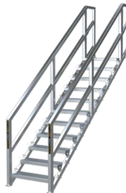
11 TO 16 STEPS