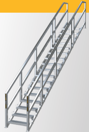
17 TO 21 STEPS