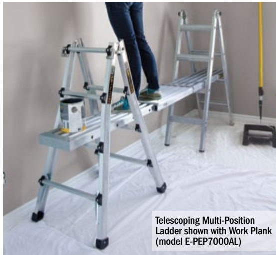
Telescoping Multi-Position Ladder shown with Work Plank (model E-PEP7000AL)