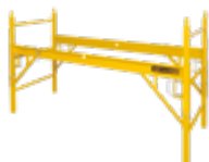
40" HIGH EXTENSION