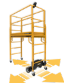
CLIMB-N-GO MOTORIZED SYSTEM