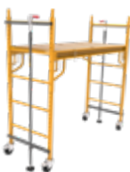
SCAFFLOCK™ SAFETY BRAKES