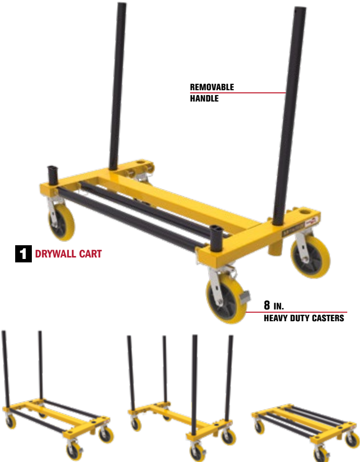
1 DRYWALL CART