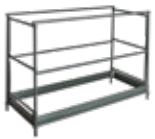
GUARDRAILS SYSTEM MODEL: I-BM6GR UPC: 778300100491