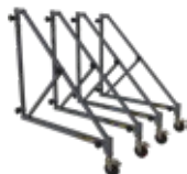
SET OF 46 IN. OUTRIGGERS WITH CASTERS FOR 3 UNITS HIGH