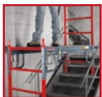
TIGHTENING HANDLE FOR MORE STABILITY