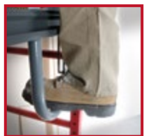
SAFECLIMB RUNG STEP

EACH END CAN ADJUST SEPARATELY TO BE USED ON BOTH LEVEL SURFACES AND STAIRWAYS