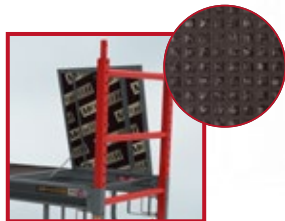
SAFECLIMB TRAPDOOR AND ANTI-SLIP DECK