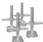
SET OF 4 LEVELING JACKS