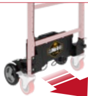
CLIMB-N-GO MOTORIZED SYSTEM FOR BAKER TYPE SCAFFOLD