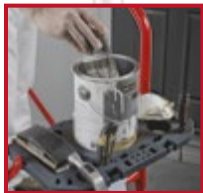
CONVENIENT FOLD AWAY TOOL SHELF FOR PAINT CAN, BUCKET, SCREWS, NAILS AND TOOLS