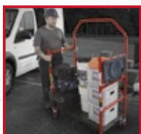
TRANSPORT 750 LB (340 KG) CAPACITY