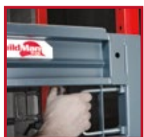
QUICK AND EASY HEIGHT ADJUSTMENT