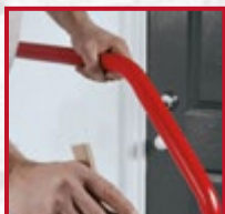
SAFETY RAIL TO HOLD ON TO, FOR STABILITY