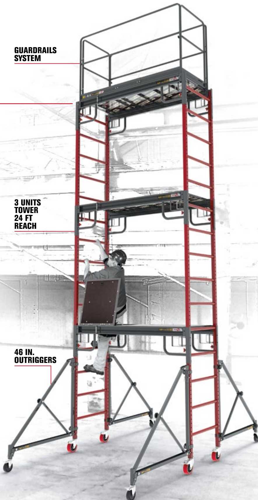
46 IN. OUTRIGGERS