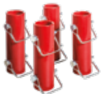
SET OF 4 COUPLING PINS MODEL: I-BM6C4 UPC: 778300100538