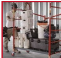
TRANSPORT 1,000 LB (454 KG) CAPACITY