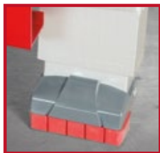
ANTI-SLIP HEAVY-DUTY FOOTING