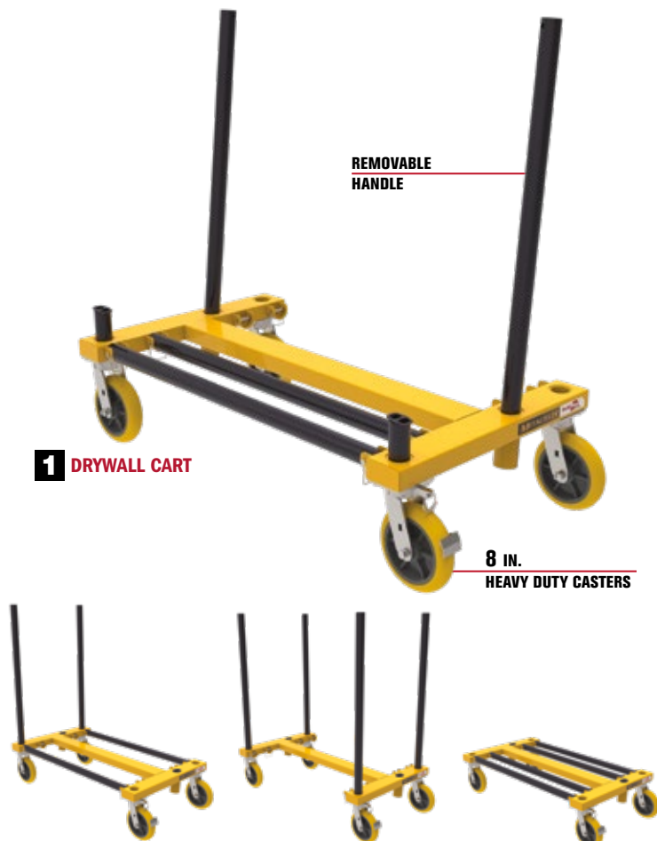
1 DRYWALL CART