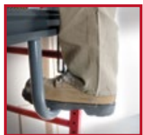
SAFECLIMB RUNG STEP