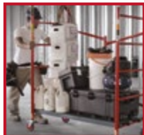
TRANSPORT 1,000 LB (454 KG) CAPACITY