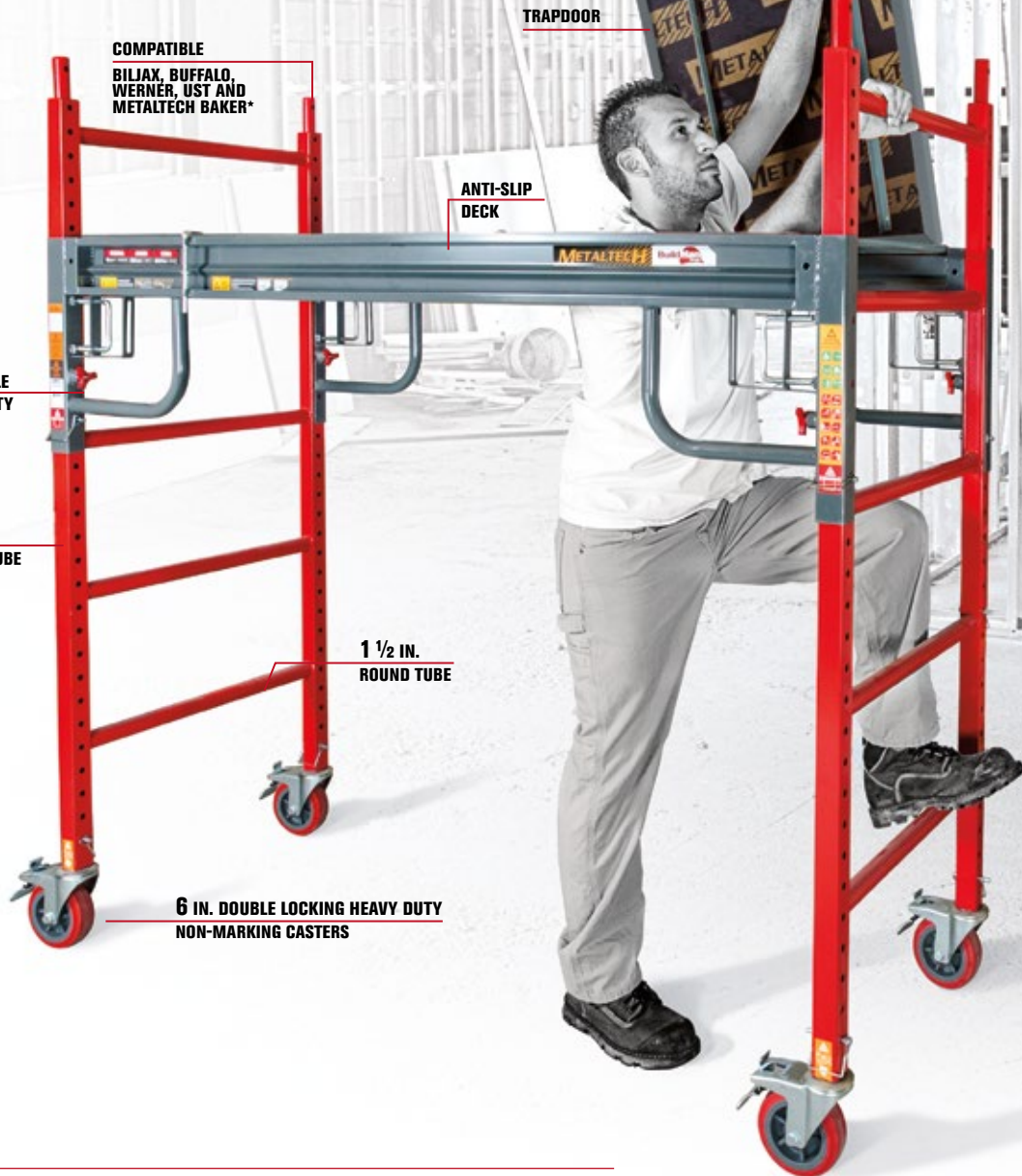
COMPATIBLE BILJAX, BUFFALO, WERNER, UST AND METALTECH BAKER*