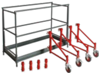
GUARDRAILS AND OUTRIGGERS COMPLETE SYSTEM MODEL: I-BM6SK UPC: 778300100361