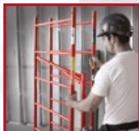
FOLDS FLAT FOR COMPACT STORAGE AND TRANSPORT