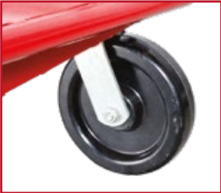
PHENOLIC CASTER LIGHTWEIGHT, PERFECT FOR CARRYING HEAVY LOADS, RESISTANT TO GREASE, OIL AND CHEMICALS.