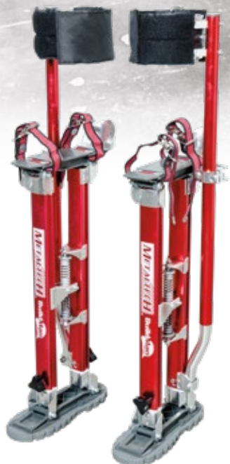
CONTACT GRIP ONE PIECE RUBBER OUTSOLE