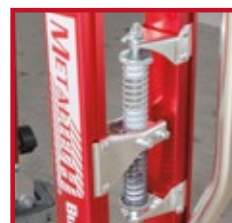
DUAL SPRING ACTION