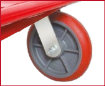
POLYURETHANE CASTER SHOCK-ABSORBING, NON-MARKING AND SUPERIOR IMPACT RESISTANCE.