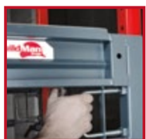
QUICK AND EASY HEIGHT ADJUSTMENT