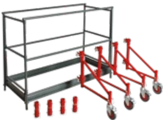
GUARDRAILS AND OUTRIGGERS COMPLETE SYSTEM MODEL: I-BM6SK UPC: 778300100361