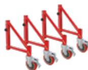
SET OF 14 IN. OUTRIGGERS WITH CASTERS FOR 2 UNITS HIGH