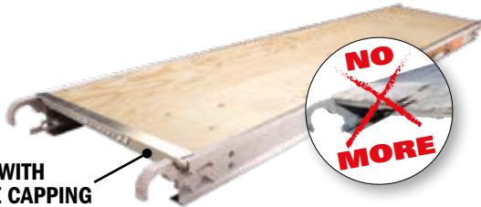
WITH EDGE CAPPING