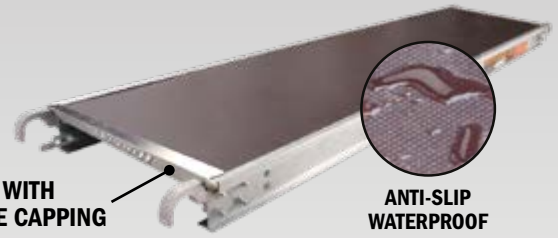
WITH EDGE CAPPING