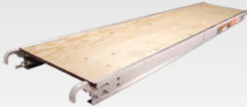
ALUMINUM PLATFORM WITH 5/8" PLYWOOD DECK