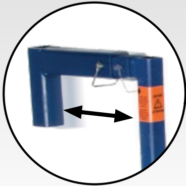
Adjustable 8" or 10"

The wall bracket is easy to install and very sturdy. Ideal for installation of platforms and work on eaves. For greater security when working on a roof, the wall bracket acts as a guardrail resulting in fewer work related accidents and fewer insurance claims. Available in galvanized finish or powder-coated blue.