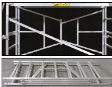
FOLDING BASE UNIT