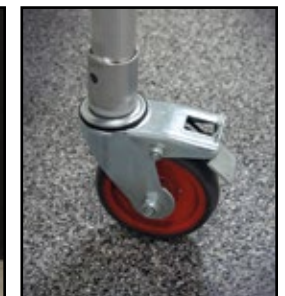
ADJUSTABLE LEG AND CASTER